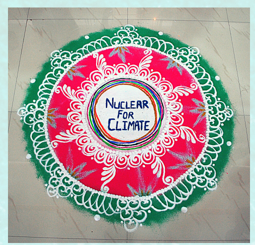
Handmade 'Rangoli' made by students of Nutan Mahavidyalaya, Maharashtra